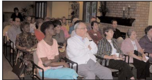
Volunteers listening about new awards

A group of 26 volunteers gathered to receive their awards for the year 2005. Volunteers represented different areas, including administration, patient care and gardening. With so many talented and truly wonderful volunteers, it was difficult to choose the best in each category.