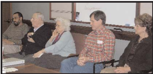
A favorite part of the training is the volunteer panel, where active volunteers come and describe some of their visits with patients, or their duties as volunteers.