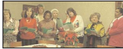
Staff & volunteers sang Christmas Carols while everyone loaded up with the feast.

surrounded all those who are known to care.